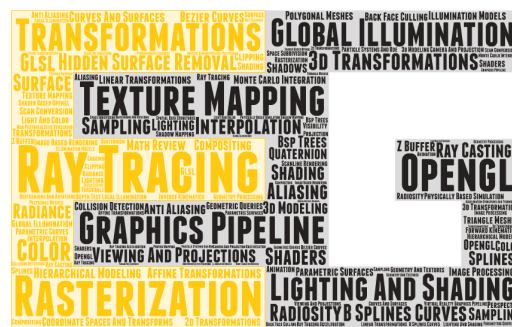
Figure 1: Word Cloud of topics taught in 20 introductory computer graphics courses from around the world, following the Eurographics logo.

3 Graz University of Technology, Institute of Computer Graphics and Knowledge Visualization, Austria